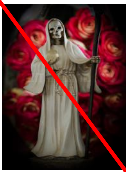
So-called "Santa Muerte" images should not be part of a Catholic Day of the Dead Altar.

Ultimately, the Day of the Dead is a celebration of life! We remember deceased loved ones and tell stories of the lives they lived among us. And, together with the whole Church, we pray that they may enter into eternal life with Christ.